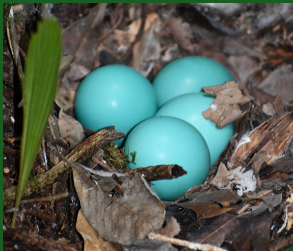
Tinamou nest at Golden Stream Corridor Preserve nature trails.

EcoTourism Belize is the eco-tour arm of Ya'axché Conservation Trust. By supporting us you are helping to achieve our vision for harmony between nature and human development for the benefit of both.