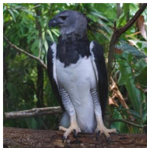
Harpy Eagle ( Harpia harpyja )

Largely protected from hurricanes, Bladen's forest has a little-disturbed structure supporting 20 intact ecosystem types and high species diversity across a great range of elevations. With its diversity of altitude, geology, aspect and hydrology, Bladen Nature Reserve offers perhaps the most diverse range of conditions for plant life of any protected area in Belize. Assessment has found tree species diversity to be highest in Central America and experts estimate upwards of 4000 plant species may be present.