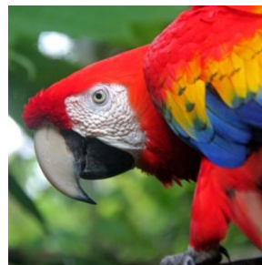
Scarlet Macaw ( Ara macao )